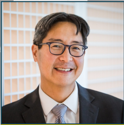
Michael J. Hsu

Join Acting Comptroller of the Currency Michael J. Hsu for the first in a series of Financial Health: Vital Signs discussions to explore issues relating to the financial wellbeing of consumers.